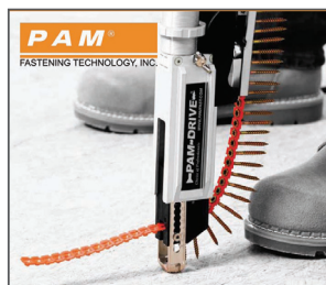
PAM Collated Flooring Adaptor