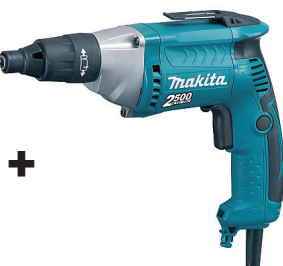
110v Makita FS2500 Motor