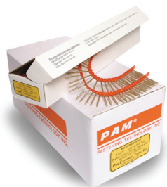
PAM Collated Flooring Screws

The system exclusively available in the UK from Evolution consists of: