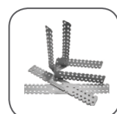
Clips & Brackets