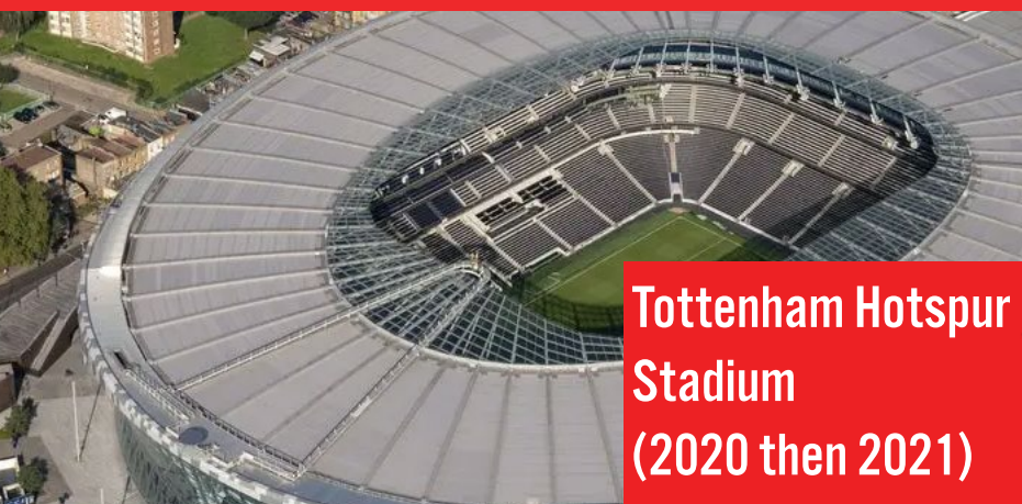
Tottenham Hotspur Stadium (2020 then 2021)