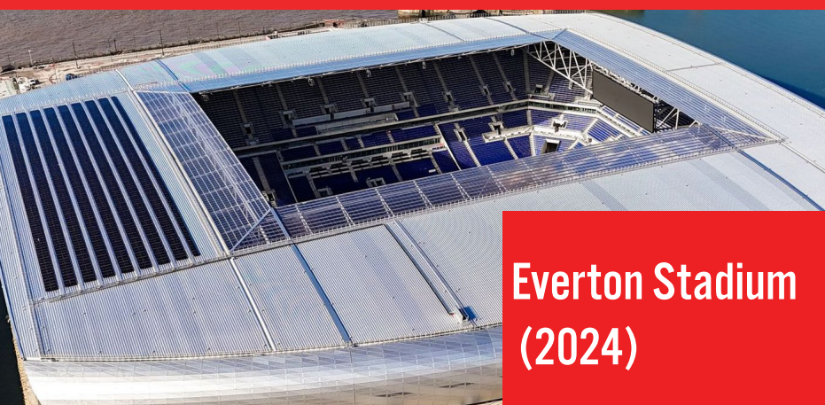
Everton Stadium (2024)