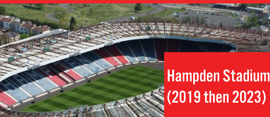
Hampden Stadium (2019 then 2023)

TRUSTED FOR THE UK'S BIGGEST STADIUM PROJECTS.