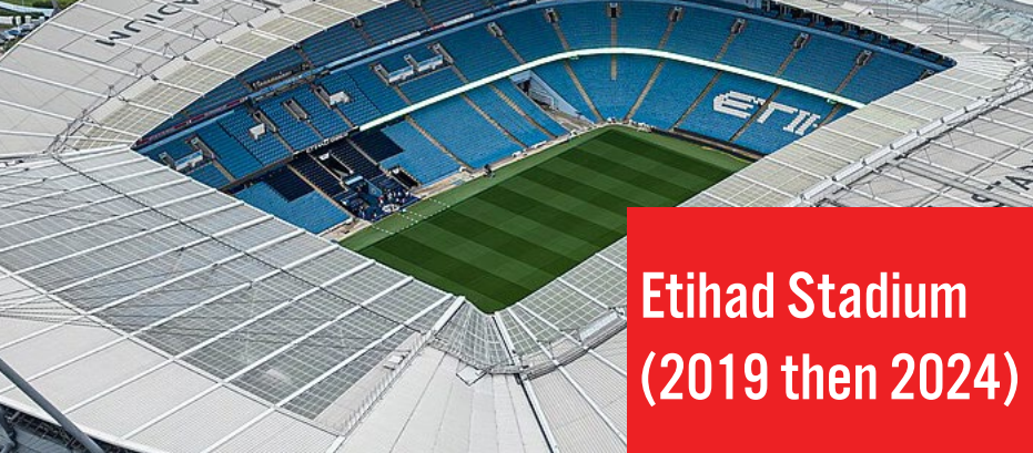
Etihad Stadium (2019 then 2024)