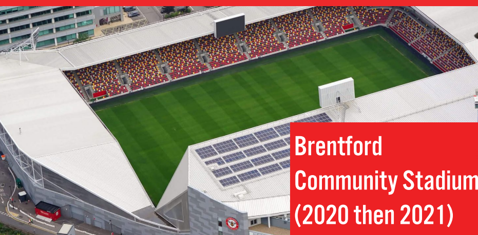
Brentford Community Stadium (2020 then 2021)